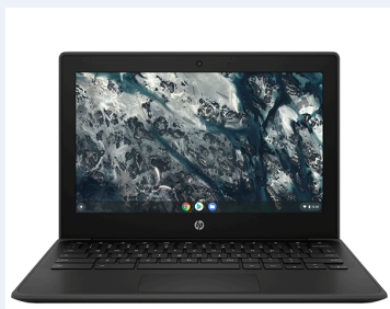
Model: HP 11.6 N100

CPU - MediaTek, 3.4GHz N100 OS - ChromeOS RAM - 4GB Screen - 11.6 LCD, 1366 x 768 Wireless - 802.11ax Battery - 2 Cell Lithium Polymer