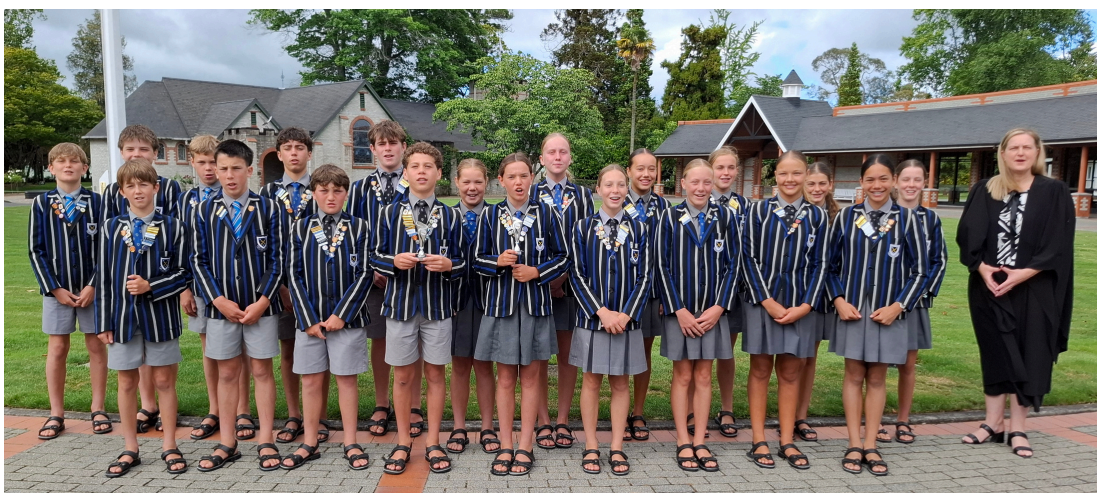
Touch Southwell Suns Winners of the Waikato Touch Assn Hamilton North Div A 7/ 8 Boys